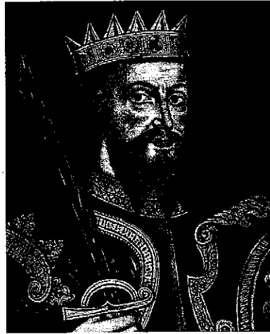
William the Conqueror Caption: William the Conqueror 1028-1087. The sword was certainly needed

I must warn you at the outset that word “capital” is used in several senses. Its fundamental meaning in economics is produced means of production which therefore excludes land (including all natural resources) as land is not man-made. It is confusing that many