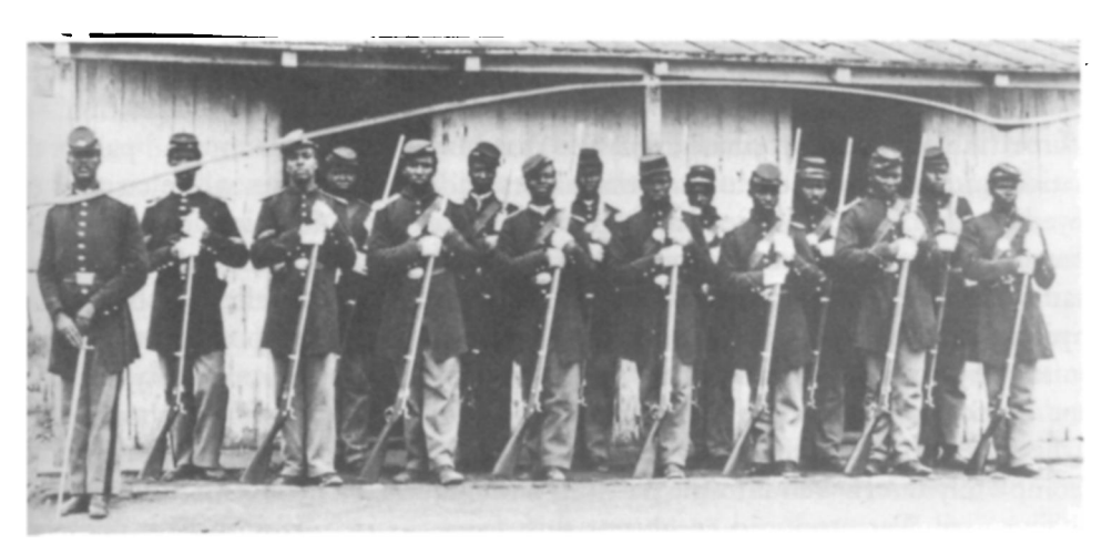
Company E, Fourth U.S. Colored Troops, at Fort Lincoln, Washington, D.C.

From the army would come many of the black political leaders of Radical Reconstruction, including at least forty-one delegates to state constitutional conventions, sixty legislators, and four congressmen.<sup>3</sup>