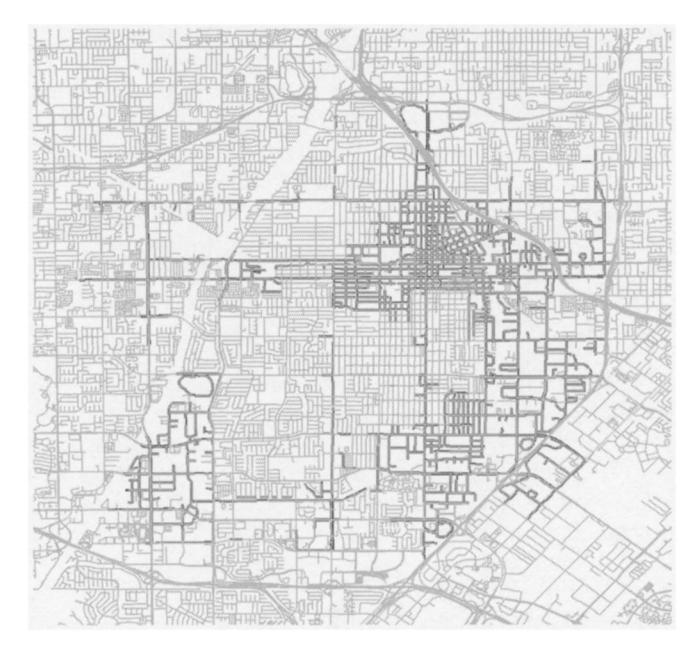
Figure 1a. Santa Ana Enterprise Zone, City Streets and Enterprise Zone as of 2004.