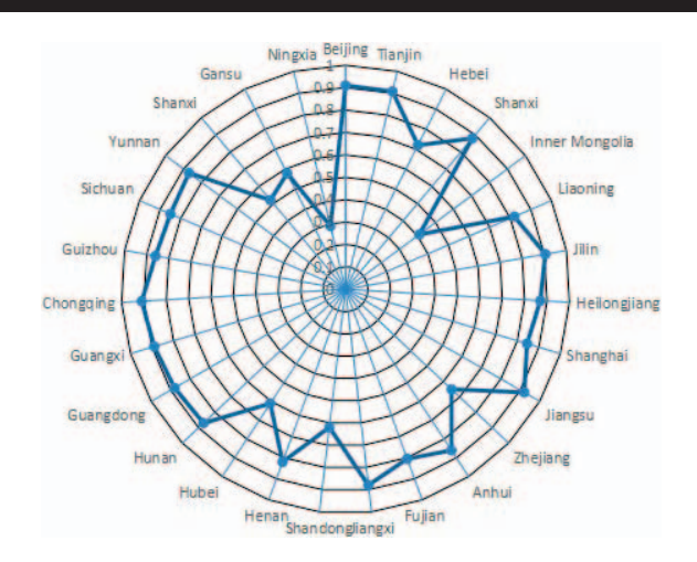
Figure 2. Average green innovation efficiency in high-end manufacturing in different regions of China.

ment of green technology innovation efficiency in China's highend manufacturing industry. The government subsidy is only an auxiliary means for the output of innovation activities (Li and Mu, 2013).