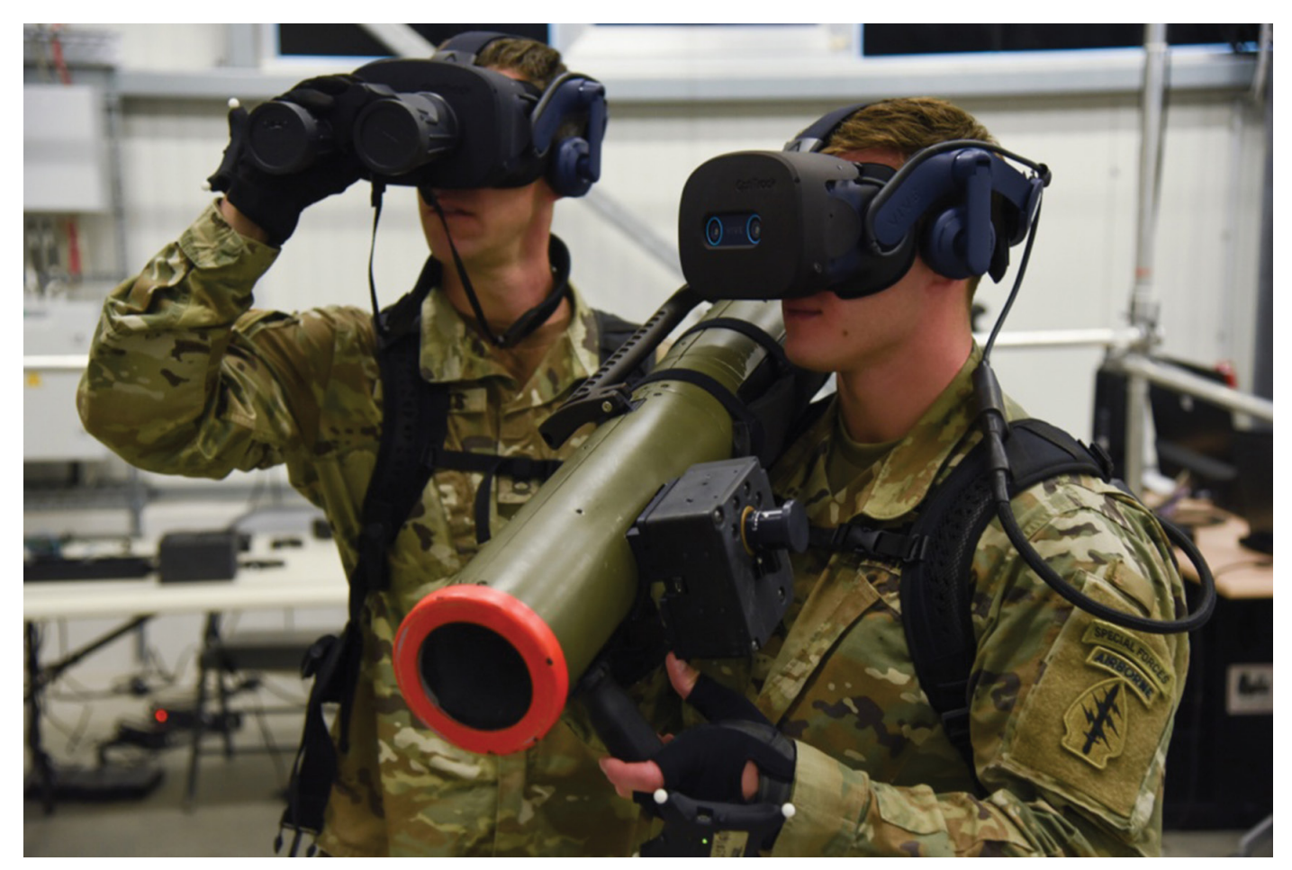
One of the US Army's eight cross-functional teams (CFTs) is dedicated to creating a synthetic training environment (STE) to improve soldier training. Here, US Army soldiers assigned to 10th Special Forces Group (Airborne) use and fire an M3E1 Multi-Role Anti-Armor Anti-Personnel Weapon System (also known as a Carl Gustav recoilless rifle) during a Reconfigurable Virtual Trainer demonstration at the 7th Army Training Command's Grafenwoehr training area, Germany, on February 13, 2020.

future warfare, and related technologies are expected to bring about great ripple effects throughout the defence industry."<sup>63</sup>