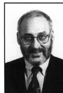
Joseph E. Stiglitz

_____. 1999e. Capital Market Liberalization, Economic Growth, and Instability. World Development . (forthcoming). World Bank. 1997. Crime and Violence as Development Issues in Latin America and the Caribbean . Mimeographed. Office of the Chief Economist, Latin America and the Caribbean. Washington, DC: World Bank.