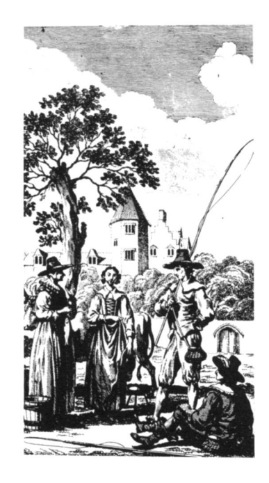
"O, Sir, doubt not but that angling is an art"—from The Compleat Angler (1653).

repel alien conquerors, achieve independence, and so it will be until the day power ceases to corrupt—not a near expectation.