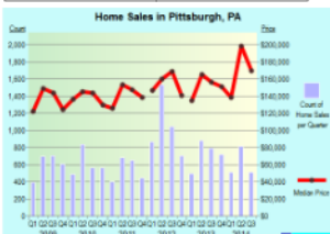
Pittsburgh's First Housing Bubble in a Century: After abolishing its land value tax, Pittsburgh is experiencing a bubble. Will these gains be wiped out in the next crash?