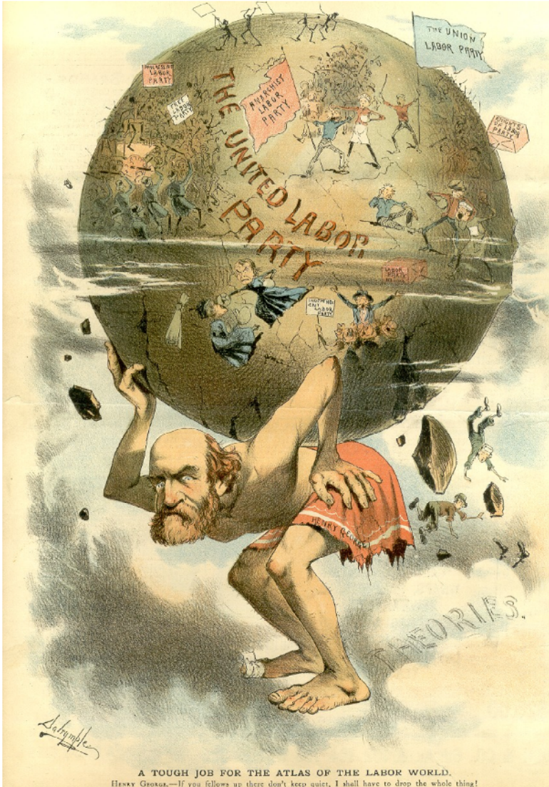
A TOUGH JOB FOR THE ATLAS OF THE LABOR WORLD. HENRY GEORGE.—If you fellows up there don't keep quiet, I shall have to drop the whole thing!

2019 Conference of Georgist Organizations Sheraton Station Square, Pittsburgh Tuesday, July 23 – Saturday, July 27