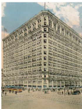
Built in 1913, just as LVT was going into effect, the Kaufmann-Baer Department Store was one of the most lavishly ornate buildings in the city, complete with a rooftop garden. It is now the Heinz 57 Center.