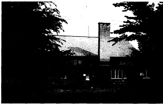
Sessions will be held in Arden's Gild Hall

Arden's experiment in land value taxation is the oldest and most successful of its kind in the United States. You will learn more about Arden and its unique past and present at this conference. Plan to be there!