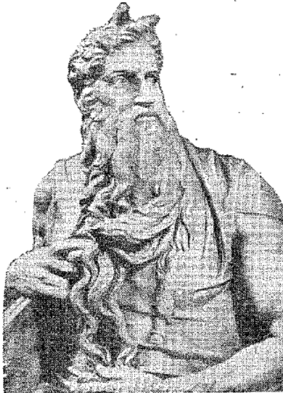
Moses by MICHELANGELO

The 25th chapter of Leviticus is one of the most important chapters in the Bible. Here is laid down what is to be done with the land of Canaan, the Promised Land, once it is entered. Here is the foundation of the economic and social life of the people. "The land shall not be