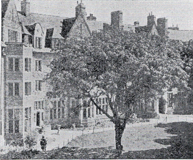
ST. SALVATOR'S RESIDENCE HALL

The Ninth International Conference to Promote Land Value Taxation and Free Trade. In St. Andrews, County of Fife, Scotland, 14—20 August, 1955.