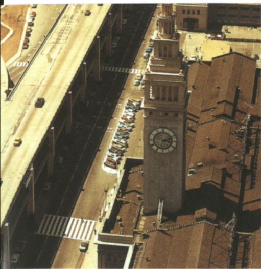
ed growth. Demolition and sealions (below left) changed that

cost difference from disaster funding. The city will eventually benefit from increased property tax values - imagine the difference in value of a hotel located next to a double deck freeway, and a hotel overlooking a park with views of San Francisco Bay.