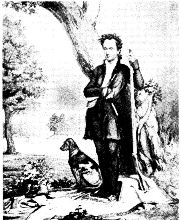
STEPHEN F. AUSTIN IN HUNTING COSTUME (Reproduced from Eugene C. Barker's, The Life of Stephen F. Austin )