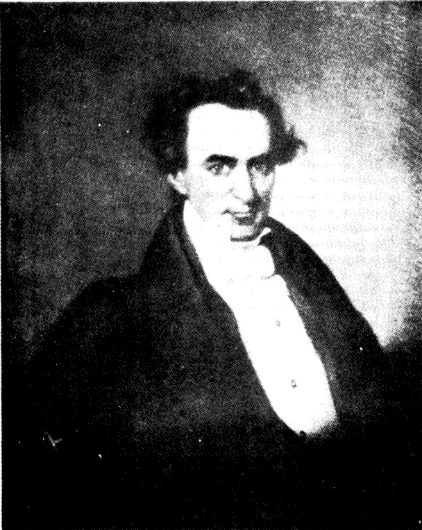
STEPHEN F. AUSTIN IN 1836 (From a portrait in the Capitol at Austin, Texas)