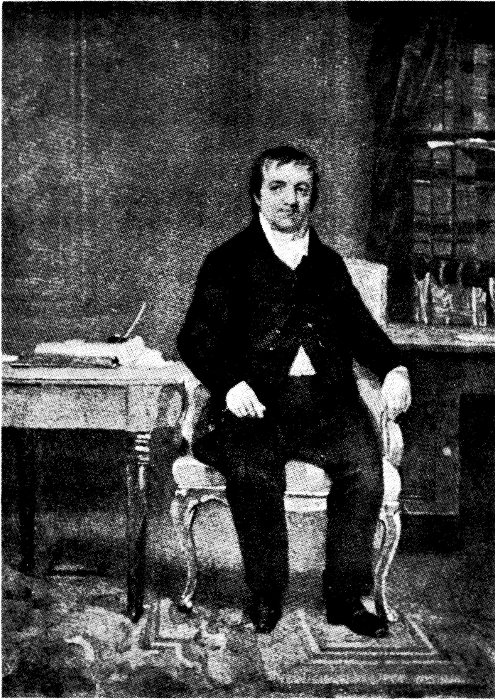
JOHN JACOB ASTOR (From a painting by Chappel)